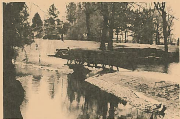
Community Development Block Grant funds were used to rebuild this pedestrian bridge in Miller Park.

During 1982, the MCEOC broadened its responsibilities after being recognized as a full Community Action Program (CAP) Agency. In light of the added responsibilities, the MCEOC contracted with the McLean County Regional Planning Commission to provide planning assistance required to meet the needs of their clientele. The Commission staff has provided general data analysis on housing and poverty in McLean County and an Emergency Energy Plan. The staff has also prepared a Housing Handbook for residents of McLean and Livingston Counties. The Commission staff also aided the MCEOC in the preparation of a Community Services Block Grant Application.