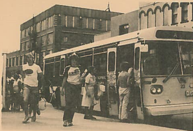
Downtown Bloomington Transfer Center on Front Street.

during 1982, planning efforts have focused on route evaluation, specific route and schedule changes based on the evaluation process, and capital improvements to the system's garage and office facilities. This package of service and facility improvements are designed to reduce overall service costs while simultaneously producing more revenues by attracting more riders.