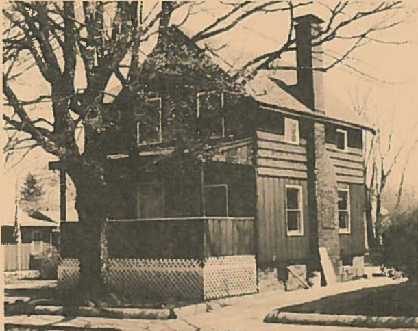
This house at 1010 S. East St. in Bloomington is being rehabilitated with Community Development Block Grant funds. The work is being done by the joint City/District 87 Vocational Education Program. The dilapidated house was acquired by the City, and participants in this training program are returning it to its intended use—a home.