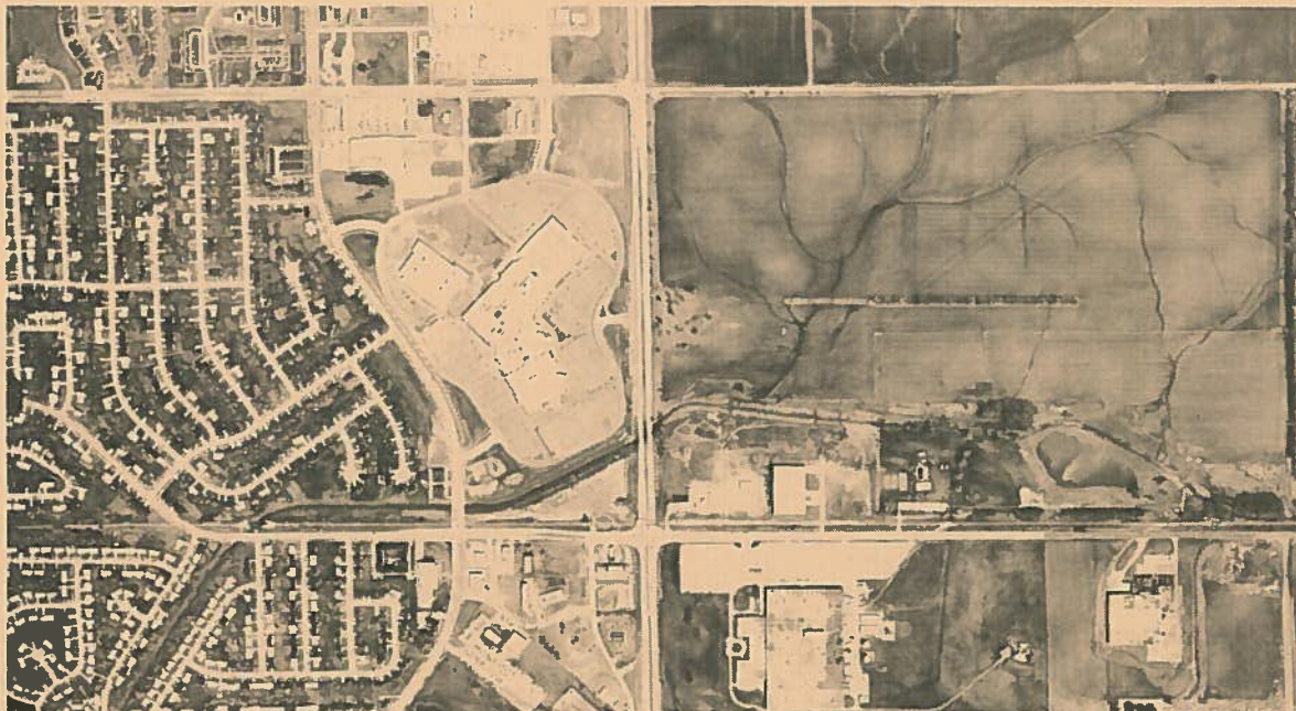
Shown above is a portion of one of the aerial photographs taken by Aero-Metric Engineering Co., Inc. as a part of the stormwater drainage study.

aerial photography has been completed and color prints delivered to the Commission. All necessary ground control has been completed and delivered to the mapping company. The Commission is negotiating an agreement with the Corps of Engineers and the Division of Water Resources to provide an analysis of stream bank overflow problems and recommendations for solving the problems identified. These studies will be coordinated with an evaluation of the storm sewer system to produce a complete plan for improved stormwater drainage in the area.